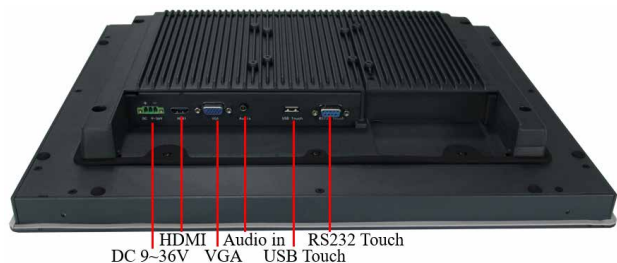
HDMI Audio in RS232 Touch DC 9-36V VGA USB Touch

ALAD-191T-G is a new industrial touch display. ALAD-191T supports 19 inches 1280*1024 TFT LCD, with 5-wire resistive touch screen, optional projected capacitive touch. There are HDMI&VGA video input, Audio input, 2*3W speakers and DC 9~36V wide power input. It is an industrial-standard multimedia display with a variety of installations that is fit for different applications.